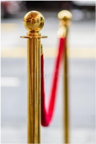
Exhibit Calendar 2023