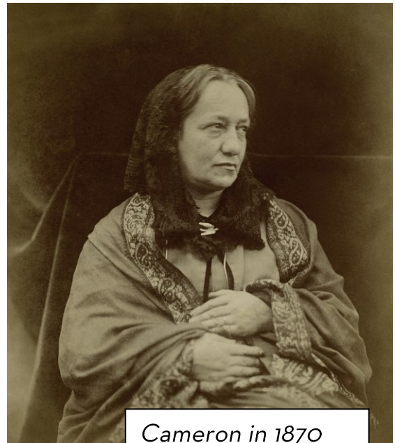
Cameron in 1870

was a British photographer who is considered one of the most important portraitists of the 19th century. She is known for her soft-focus close-ups of famous Victorian men and women, for illustrative images depicting characters from mythology, Christianity, and literature, and for sensitive portraits of men, women and children.