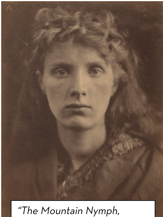
“The Mountain Nymph, Sweet Liberty”, June, 1866

After establishing herself first among Calcutta's Anglo-Indian upper-class and then among London's cultural elite, Cameron formed her own salon frequented by distinguished Victorians at the seaside village of Freshwater, Isle of Wight .