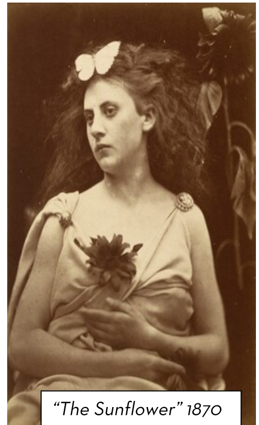
“The Sunflower” 1870

After showing a keen interest in photography for many years, Cameron took up the practice at the relatively late age of 48, after her daughter gave her a camera as a present. She quickly produced a large body of work capturing the genius, beauty, and