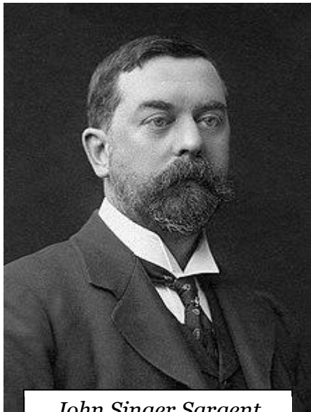
John Singer Sargent

John Singer Sargent ( / ˈ s ɜːr d z ɪ n t / ; January 12, 1856 – April 14, 1925) [1] was an American expatriate artist, considered the "leading portrait painter of his generation" for his evocations of Edwardian-era luxury. [2][3] He created roughly 900 oil paintings and more than 2,000 watercolors, as well as countless sketches and charcoal drawings. His oeuvre documents worldwide travel, from Venice to the Tyrol , Corfu , Spain , the Middle East , Montana , Maine , and Florida .